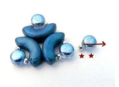
4) Pick up 1 SB15 and 1 Kalos