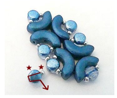
10) Pick up 1 SB15 and 1 Kalos. Exit HERE through the second hole of the Kalos