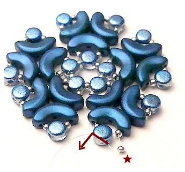
13) Pick up 1 SB15 through the second hole of the Kalos