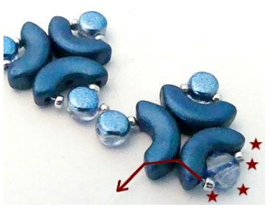
7) Repeat step 6 and exit HERE through the next Arcos