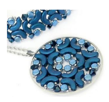
21) Congratulation ♥ The pendant is finished. You can wear « Trianon Earrings » ♥

I wish you a happy beading. I offer you this pattern. Please do not change its design and only use Les Perles par Puca®-Paris If you publish or share this pattern « THANK YOU » for not forgetting to notify that it is Puca® who created it.