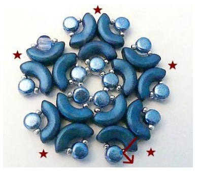
12) Repeat the steps to obtain 5 modules. Exit HERE through the SB15