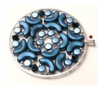
20) Insert the Bail Pendant and chain