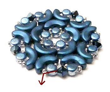
16) Here is the result Exit HERE from the first SB15