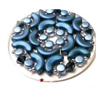
17) Place the circle