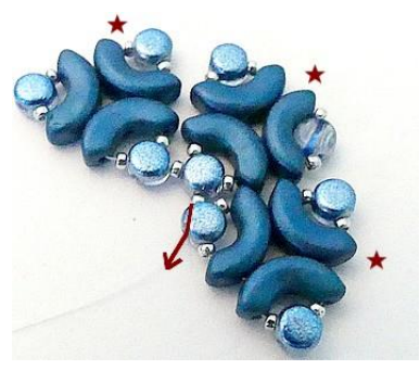
11) Repeat steps 4 to 10. We get 3 modules