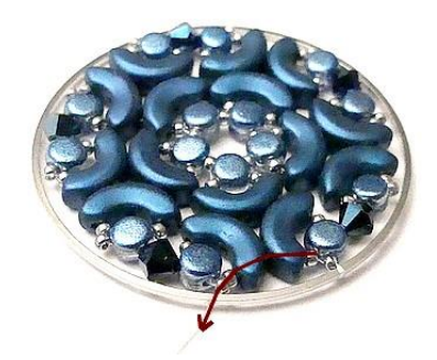
19) Exit HERE through the SB15. Repeat steps 18 and 19 all the row. End your thread ©