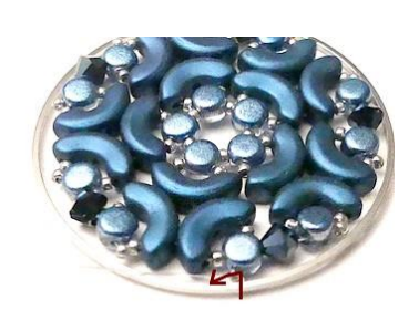
18) Pass under the circle and exit through the SB15 to step 16