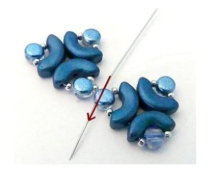
9) Exit HERE through the second hole of the Kalos