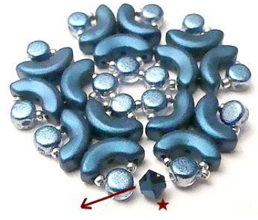
14) Pick up 1 B4 through the second hole of the next Kalos